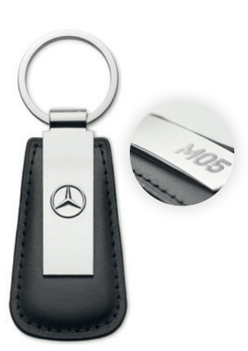
MK1005 Zinc alloy and PU leather key ring.