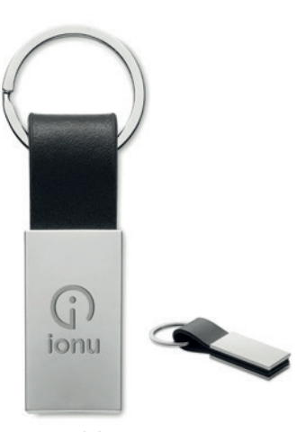
MK1007 Zinc alloy and PU leather key ring.