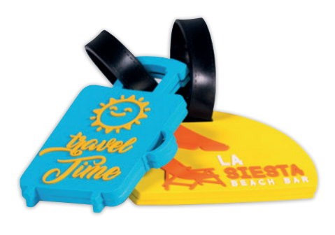
MT1003 2D custom shape luggage tag.

ML2004 Fine Polyester luggage strap with detachable buckle. Also available in RPET (ML2104)