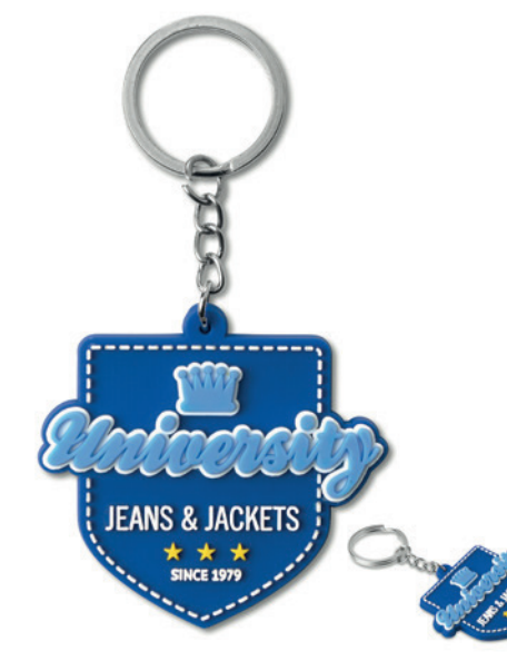
MK1001 2D PVC with design on 1 side.