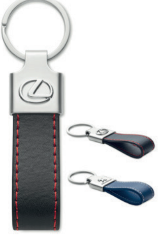
MK1006 Zinc alloy and PU leather key ring.