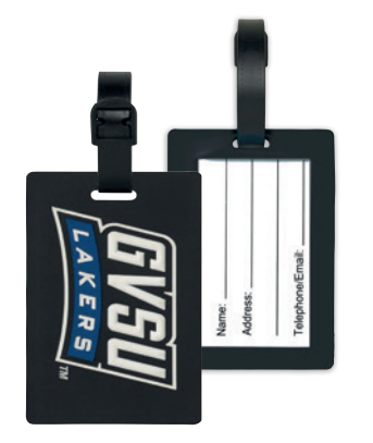
MT1002 Small luggage tag. Size: 65(w)x80(h) mm.

Flat Polyester luggage strap with detachable buckle. Also available in RPET (ML2101)