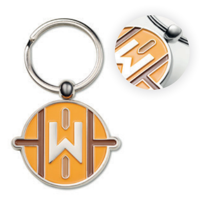
MK2007 Zinc alloy. With rotatable ring and soft enamel (recessed surface).

MK2006 Nickel plated zinc alloy with imitation hard enamel (smooth surface).