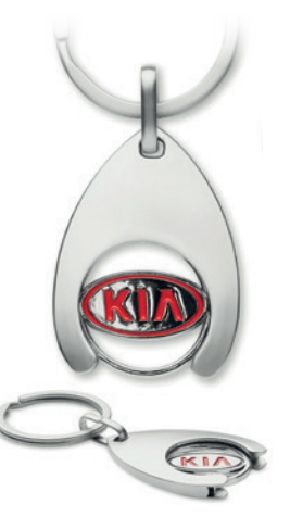
MK4010 Claw shape