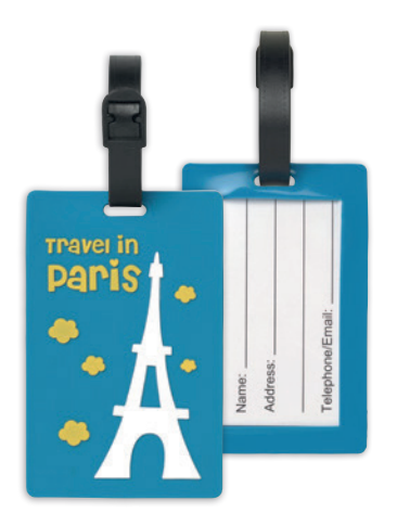
MT1001 Large luggage tag. Size: 65(w)x104(h) mm.

Full colour Suitcase jacket & backpack holder. Also available in RPET (ML2106)